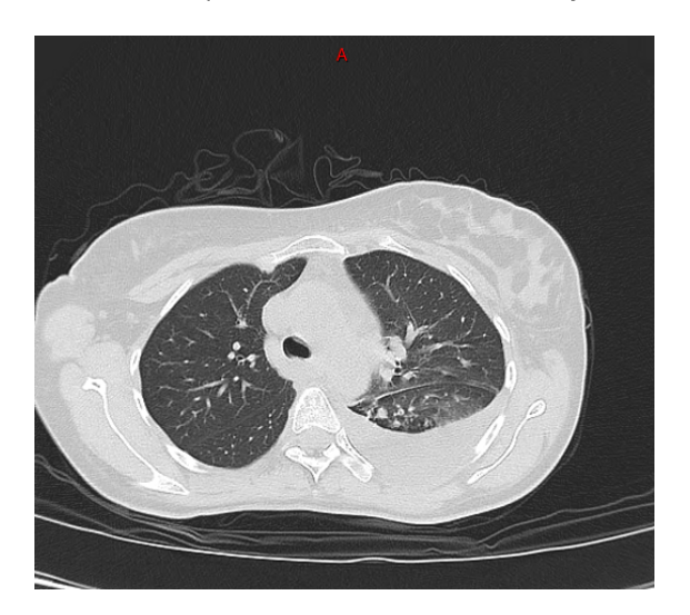
Figure 2: CT angiography of the chest moderate left pleural effusion millimetric nodules, and mild left atelectasis with no signs of pulmonary embolism or lymph node enlargement were visible.

developed diarrhea, initially watery, then bloody and mucoidal. The patient was started on ciprofloxacin 400 mf IV every 12